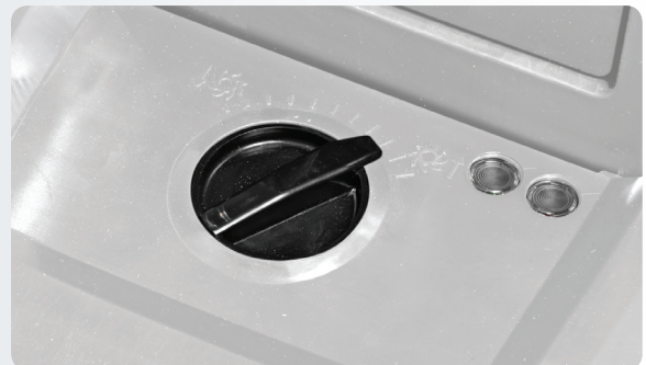
Indicators guide the user